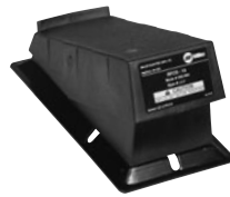
#194 744 remote shown.