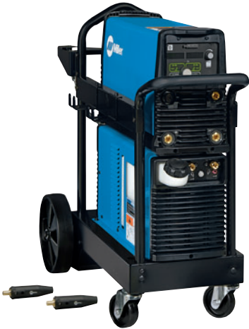
#907 538 002 Maxstar 280 TIGRunner™ shown with four bottles of #043 810 Low-Conductivity Coolant.

Select desired stock number for each step.