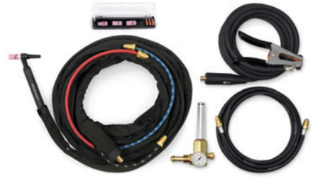
#300 990 kit shown.