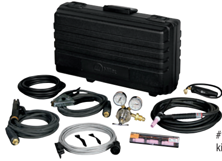
#195 055 kit shown.