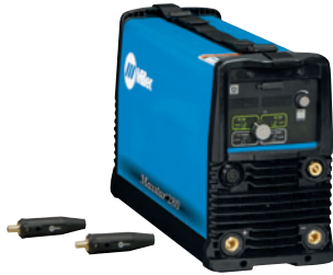
#907 552 Maxstar shown.

Select desired stock number for each step.