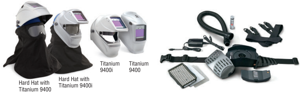
Hard Hat with Titanium 9400 Hard Hat with Titanium 9400i

InfoTrack™ is a Miller exclusive technology that allows the lens to track arc time while under the hood. Technology also includes a digital clock display with the ability to set an alarm or timer.